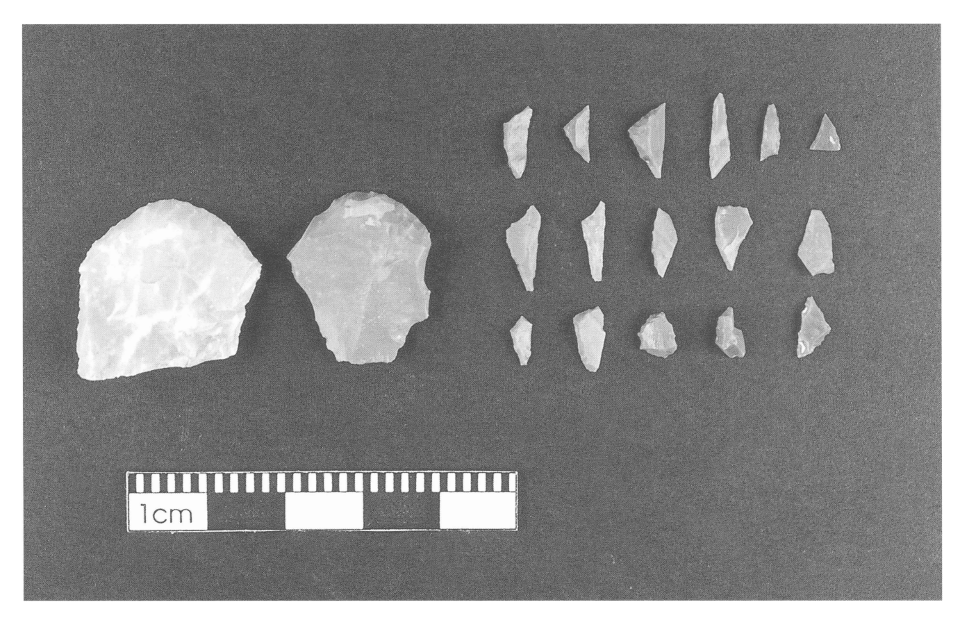
Fig. 1 - Lithic industry of the Early Mesolithic